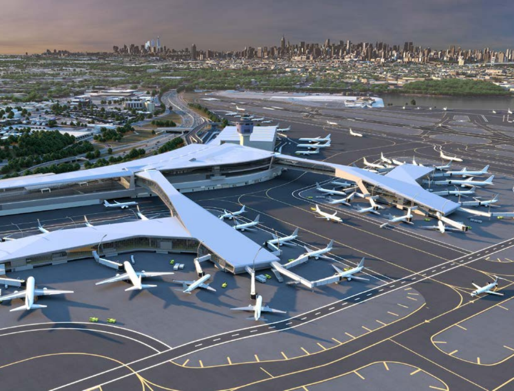
Laguardia Airport's Central Terminal B, Queens, NY