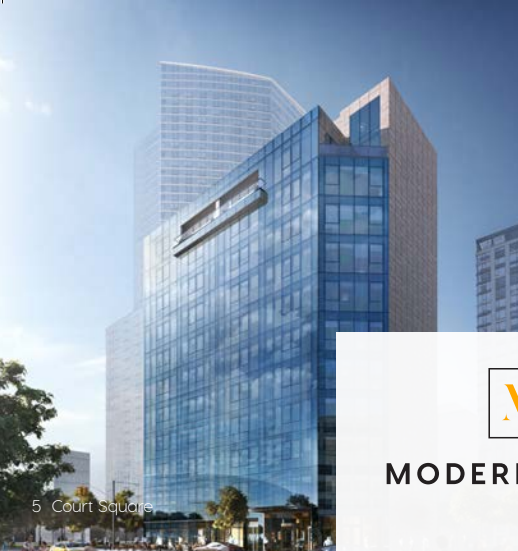
5 Court Square